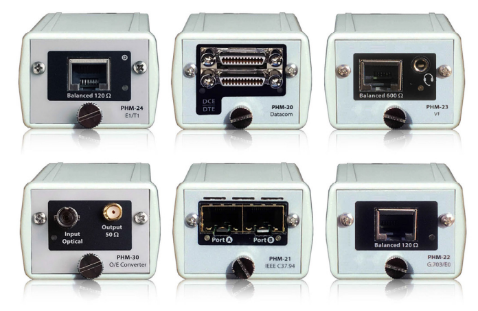
Fig3. Modules for IRIG-B, Datacom, C37.94, Codirectional, VF...

xGenius is equipped with a unique technology that ensures packet capture of selected flows and then save them in PCAP format of live traffic in full duplex mode. You can overcome most of the limitations of capture devices, firewalls, protocol analyzers running on Laptops or PCs.